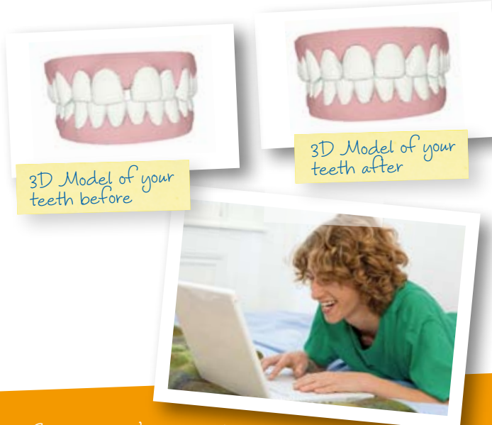
3D Model of your teeth before

Get started right away – ask your dental practitioner if Invisalign Teen is right for you!